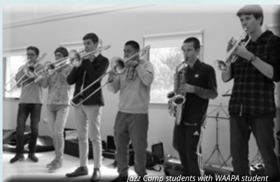
Jazz Camp students with WAAPA student