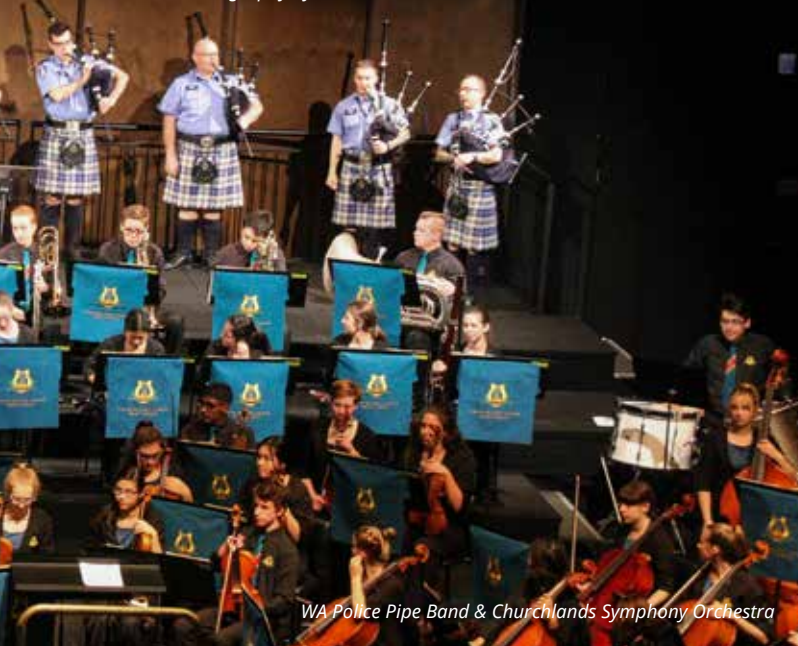
WA Police Pipe Band & Churchlands Symphony Orchestra